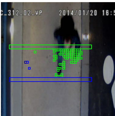
Counting of pedestrians